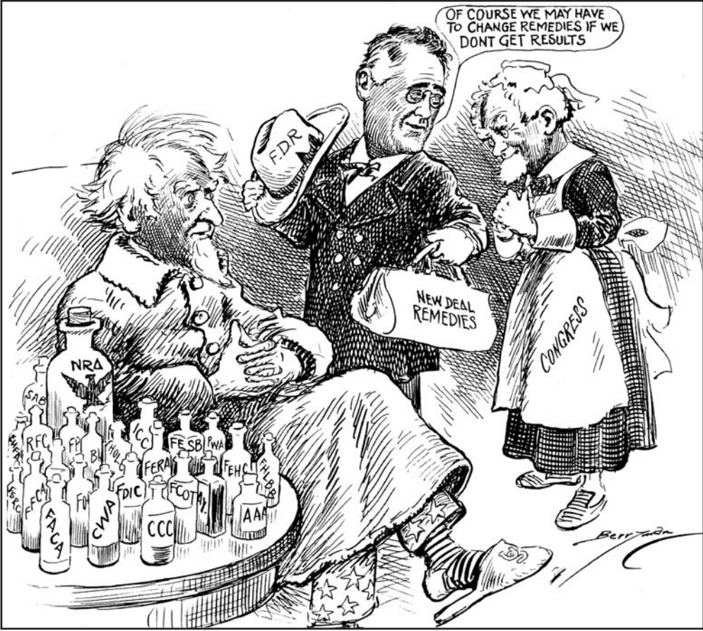
Source: Clifford Berryman, Washington Star , January 5, 1934, Library of Congress

8b According to this document, what was one step taken by President Franklin D. Roosevelt to solve the problems of the Great Depression? [1]