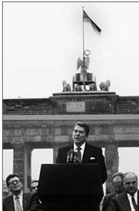
President Ronald Reagan speaks on the West Berlin side of the Brandenburg Gate, June 12, 1987.

Source: President Ronald Reagan, speech at the Brandenburg Gate, June 12, 1987